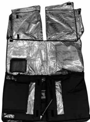
77L Dual Zone Model

Position the fridge on the base of the cover with the control panel facing the Left side as shown in the picture below (the 4 cutouts are where the feet on the fridge sit)