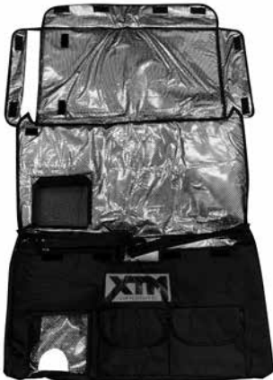
41L & 54L Models

Remove cover from packaging and lay on a flat surface with the silver side facing up