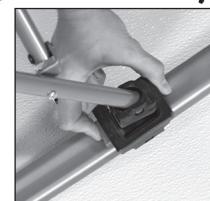
Depress green buttons to release rockers.