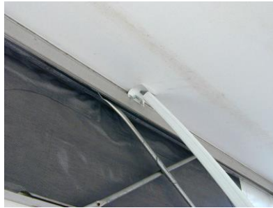
FIT POLE END INTO WALL BRACKET FIXED TO SIDE OF VAN