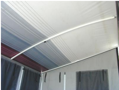
FITTED IN CONJUNCTION WITH ANTI FLAP KIT AND WALLS