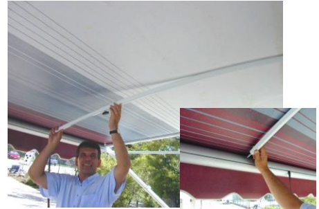
EXTEND OUT FRONT TELESCOPIC SECTION AND FIT SPIGOT INTO HOLE IN ROLLER