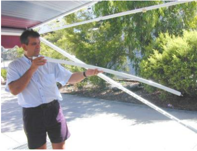
RAFTER RETRACTED FOR TRAVEL

The Curved Roof Rafter is particularly effective when used in conjunction with our Anti Flap Kit, with or without the addition of walls.