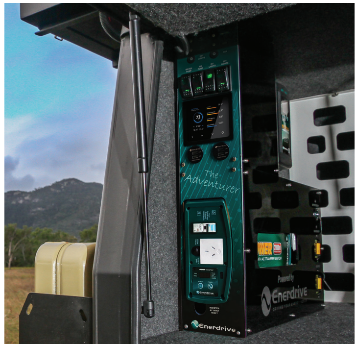
*Passenger side, Simarine with x2 USB Outlets pictured