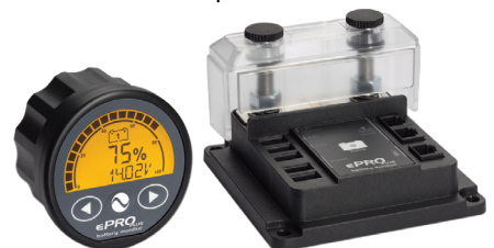
*Standard ePRO Plus Battery Monitor