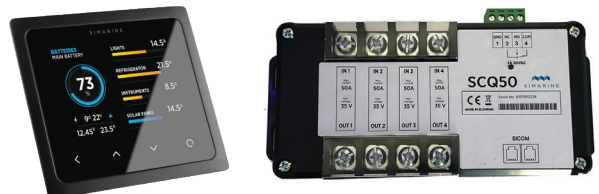
*Optional Simarine Pico Monitor and SCQ50 Shunt