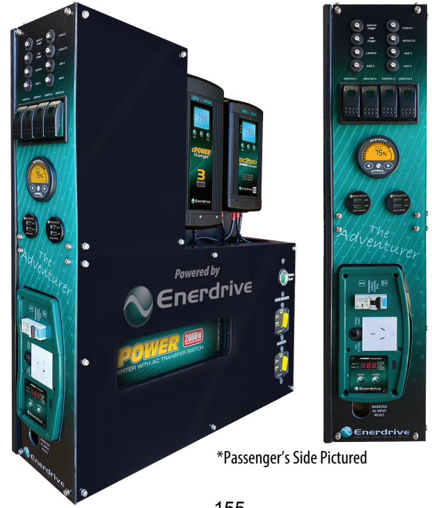
*Passenger's Side Pictured