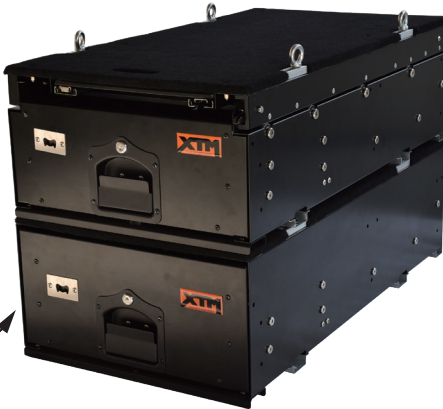
4WD Single drawer (PLU 584030)